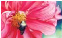
Bumblebee by Guy Magallanes

Fee: $180 members; $215 non-members. Fee includes all materials. This class is perfect for students with little or no experience.