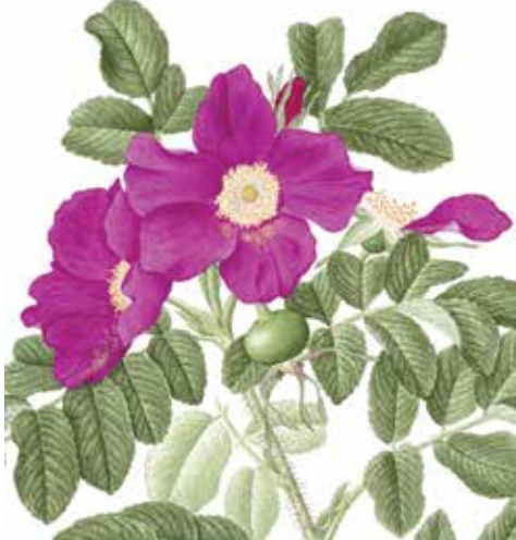
Rose by Catherine Watters

Botanical art combines the observational skills of a scientist and the sensibility of an artist to create beautiful and accurate renderings of plants. The Filoli Botanical Art Certificate Program offers a unique in-depth study of botanical art through challenging, integrated, and comprehensive courses. The curriculum includes the systematic study of artistic skills and concepts, basic botany, and botanical art history. Enrollment in the certificate program is not necessary to participate in these classes however, prerequisites must be completed. To enroll in the Certificate Program please complete the enrollment form available on our website or in the classroom.