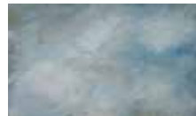
Cloudy Sky by MaryJo Koch

For this class we'll study the work of John Constable (1776-1837) and apply it to your own work. Constable once noted that the sky is the "chief organ of sentiment" in a painting, and indeed this is a very important observation. Obviously the sky above us provides the light that plays across the surface of the earth, and where there are clouds they screen, soften and diffuse that light. We'll learn how to render the ever-changing sky as Constable painted them by using very light preliminary pencil sketches then practicing different painting strategies and brushwork to create a unique sky painting of your own. Fee: $210 members; $250 non-members. Fee includes materials; bring your own if you have them. This class is well-suited for all levels of experience.